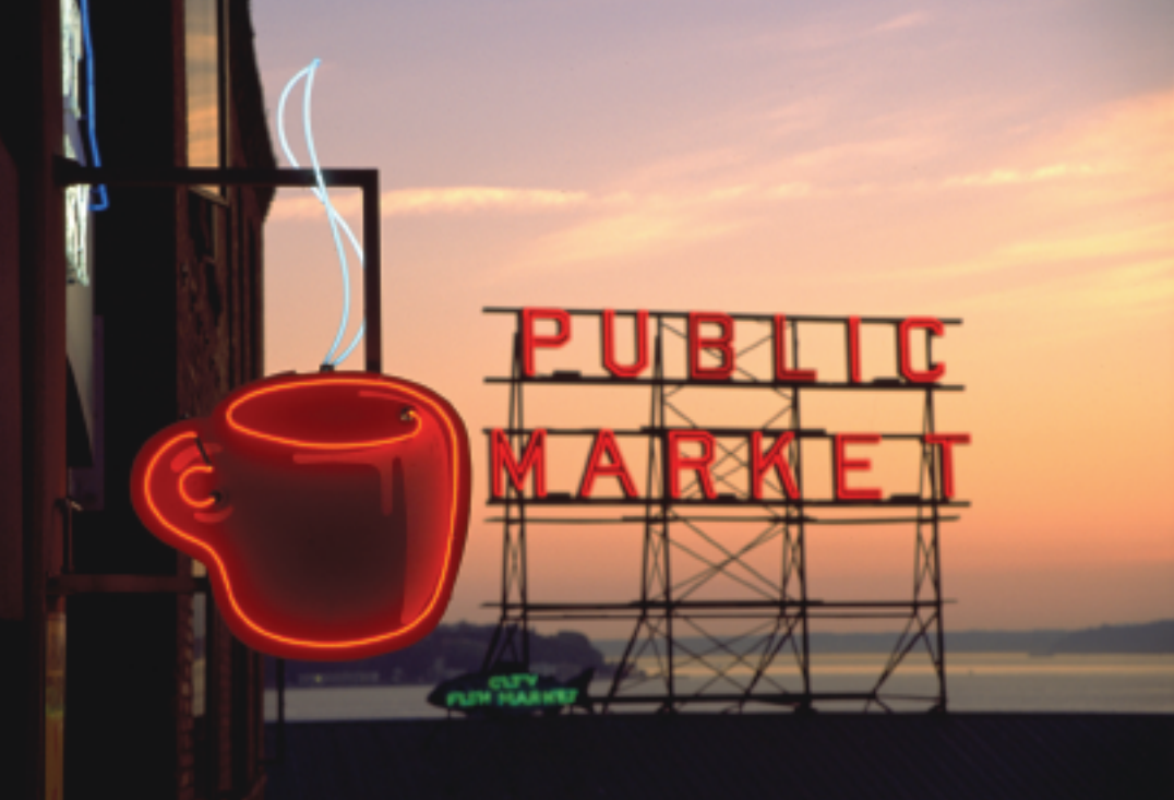
Seattle Public Market.