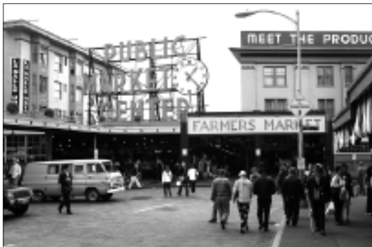
Pike Place Market.

“Content is relevant and extremely useful and helpful. These conferences are excellent and invaluable to those who provide legal services to the poor.”