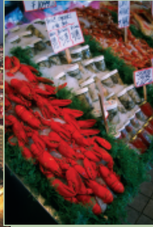
Left: The Seattle Westin Hotel with the Space Needle in the distance. Above: Lobsters at the market.