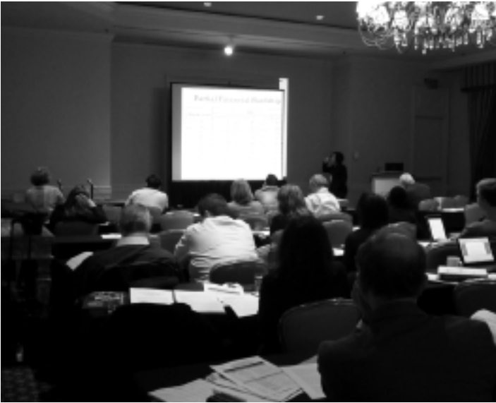
Intensive at the 2011 Consumer Rights Litigation Conference in Chicago.