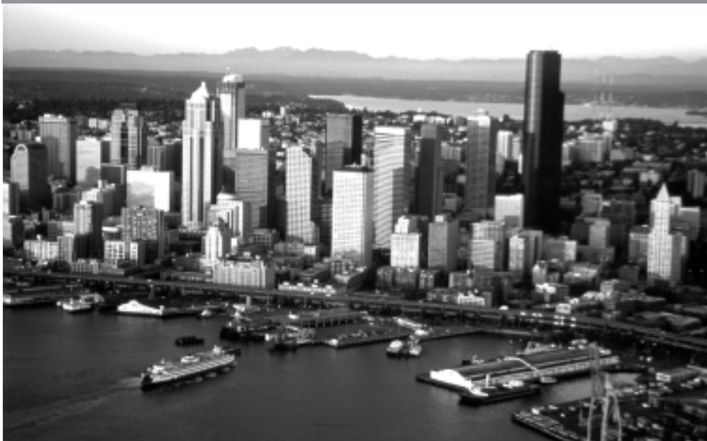
Sunset over Seattle.

The agenda is subject to change to accommodate speaker availability and late beaking developments. See www.nclc.org for latest agenda and breakout course descriptions.