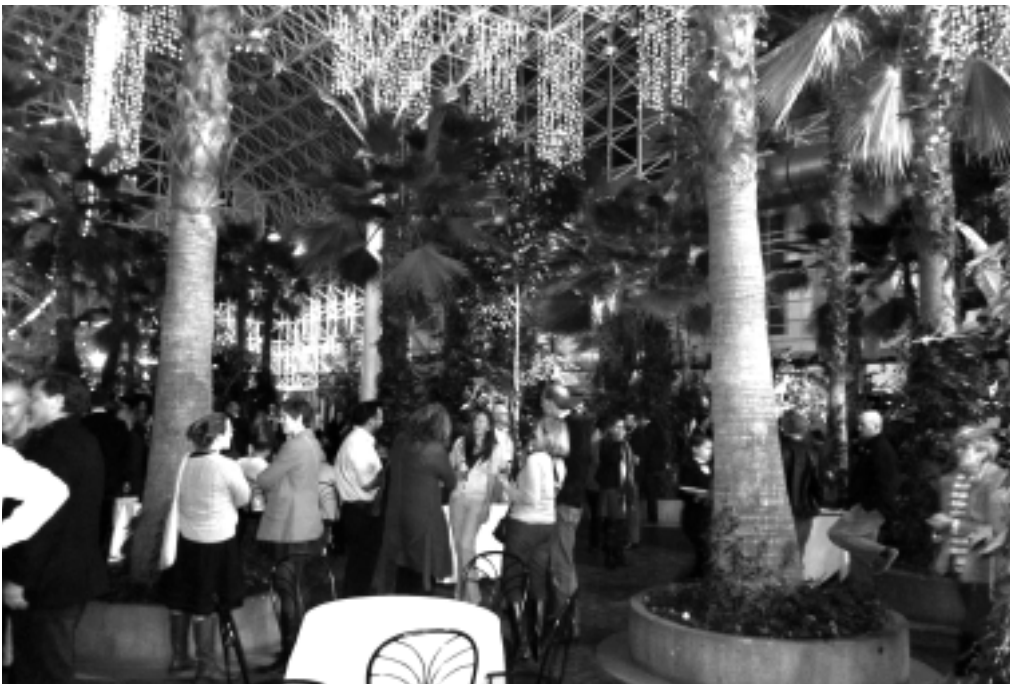
Host Committee Reception at the 2011 Consumer Rights Litigation Conference in Chicago.

NACA —Annual Meeting, Media and Trial Advocacy Awards with Cash Bar and Silent Auction