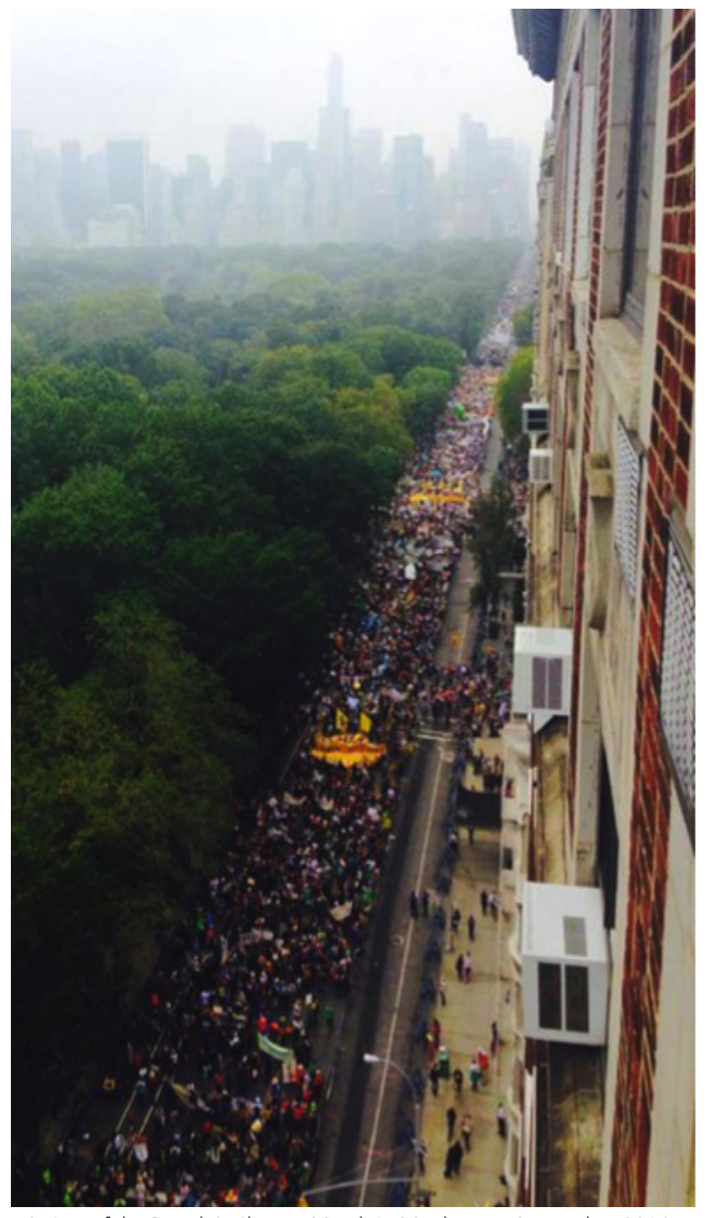
A view of the People's Climate March in Manhattan, September 2014.

This year, our convention will take place in legendary Greenwich